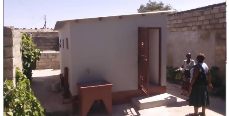
Garden teachers at new bathrooms and shower facility.

Our supporters fund salaries for the two teachers who run the Garden preschool and teach about 50 children in two classrooms. Recently our supporters' funds built lavatories and a shower. Earlier donor funds had paid for reconstructing the main gate and perimeter security walls. Now a caretaker and his family live in the back of the school and maintain security.