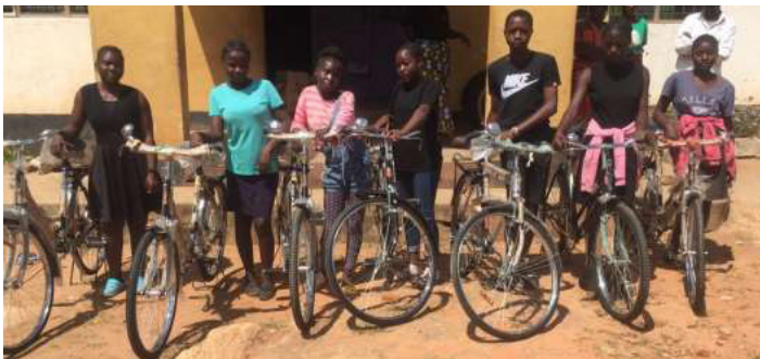
students use bicycles for 14-kilometer trips to and from school.

This year CWB donor funds paid for an entire set of textbooks for all subjects in grades 1-9 and for high school tuition, bookbags, bicycles, books, shoes, uniforms, pens and pencils for all students who passed 9th grade exams.