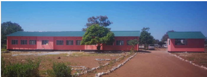
Now Sekelela has new classroom and kitchen buildings.

Last year, after an extensive search for a local builder, we used donor funds to construct a three-classroom building and a kitchen building. The classrooms are now filled with students all day. There are now 12 experienced teachers funded by our supporters. Members of the community cook lunch for the students so they have the energy to study all day.